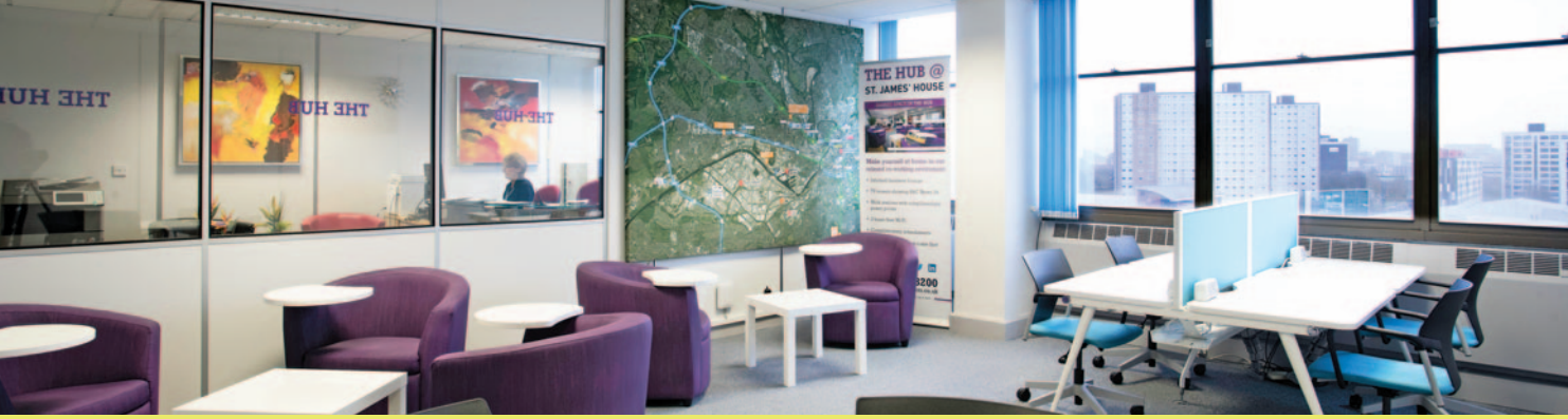
shared business lounge, THE HUB