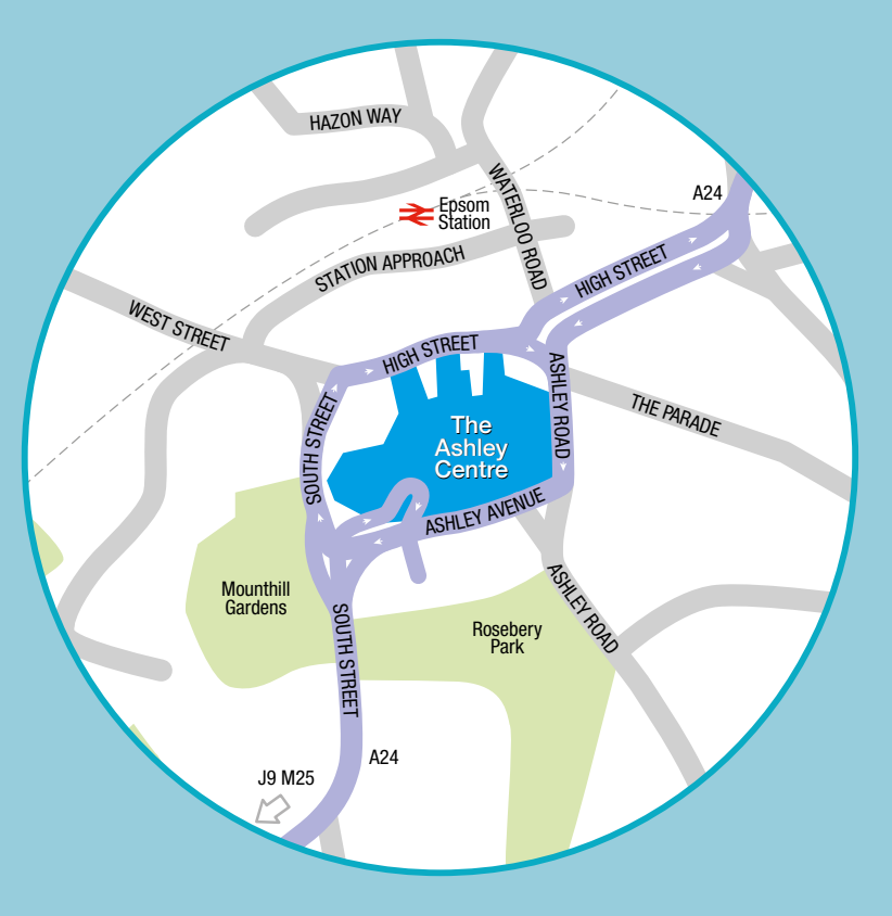
SAT NAV KT18 5AB

THE AFFLUENT TOWN OF EPSOM IS LOCATED IN THE COUNTY OF SURREY, 18 MILES (29KM) SOUTH-WEST OF CENTRAL LONDON, WITHIN THE M25. THE NEAREST COMPETING CENTRES INCLUDE CROYDON, 9 MILES (14KM) TO THE NORTH-EAST, KINGSTON-UPON-THAMES, 7 MILES (11KM) TO THE NORTH AND GUILDFORD, 16 MILES (26KM) TO THE SOUTH-WEST. THE TOWN IS HOME TO THE EPONYMOUS RACECOURSE, WHICH HOLDS THE EPSOM DERBY EVERY YEAR.