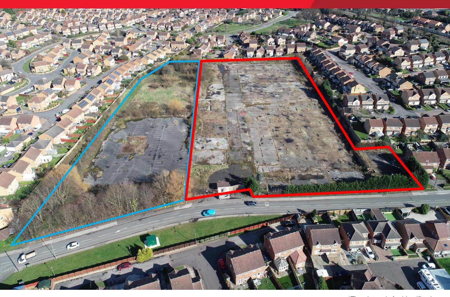
*The picture is for identification purposes only

Land at Monkhill Lane, Pontefract, WF8 1RL