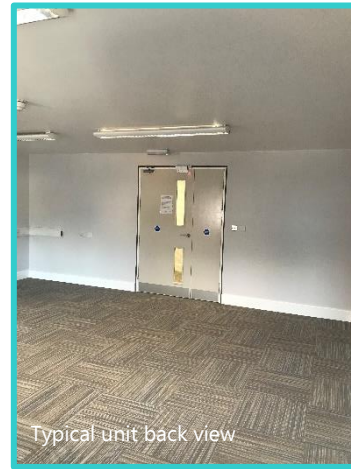
Typical unit back view

Rent and service charges are invoiced quarterly in advance and clients can opt to pay monthly by direct debit.