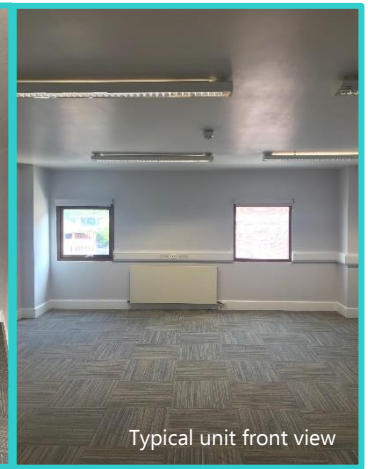
Typical unit front view