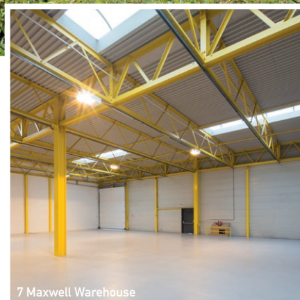
7 Maxwell Warehouse