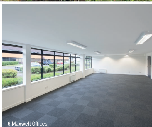
6 Maxwell Offices